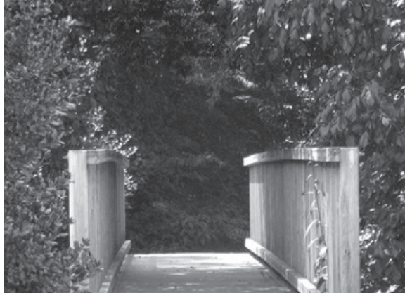
Dense tree and shrub planting that obscures the view from open spaces may encourage misuse and pose threats to pedestrians using footpaths.

In contrast, here are some good design features the Nottingham graphic identify: