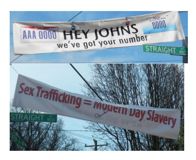
Customer Service and Quality of Life Issues

The neighborhood association most affected by the problems related to prostitution meets on a monthly basis. Following one of their meetings, a banner was erected at one of the more prominent intersections for open-air prostitution that read, "Johns we have your number" on one side and "Sex Trafficking is Modern Day Slavery" on the other.