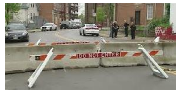
April 30<sup>th</sup>, 2014

The police department continued to engage stakeholders and recognized this would be a somewhat controversial approach. Some would call it a drastic action to a drastic problem. Following press releases and a media blitz, the temporary barricades were installed for a period of 90 days.