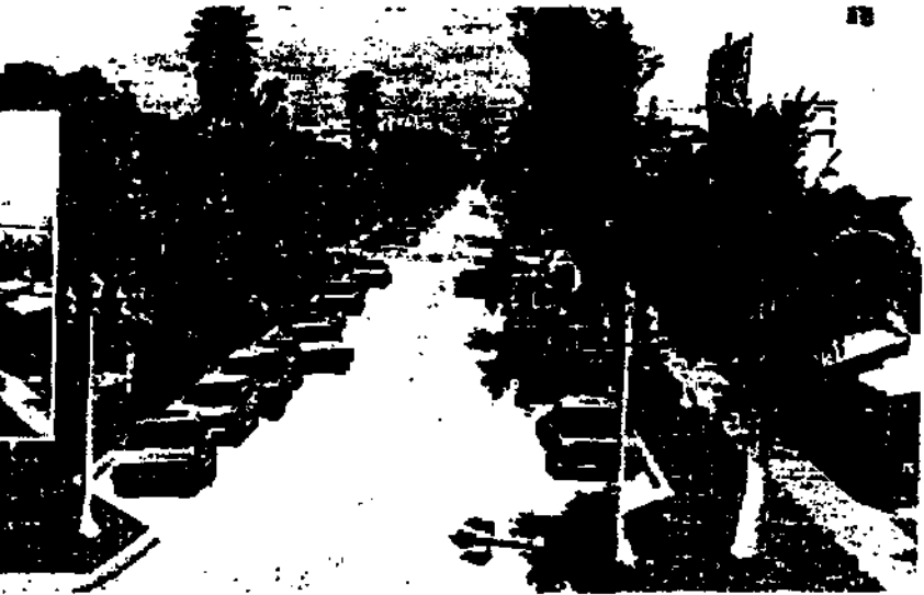
Graphics show how the failure to define space results in general disarray and gives the appearance there is no ownership. Adding curbs, gutters, sidewalks, landscaping and designated parking spaces defines territory and improves the sense of ownership/social control. (Note—no gate or guard!)

Three fundamental "Principles for Good Neighborhoods" developed for Hillsborough County (Florida) show how good neighborhood design is compatible with the CPTFD design concepts of natural access control, natural surveillance, and territorial behavior.