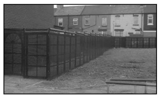
Alley gates, installed extensively in Liverpool, England, have proven a cost-effective method of reducing residential burglaries.

Research design: Strong. In fact, the combination of the large number of alley gates covered in the evaluation, the effort made to examine displacement/diffusion, and the cost-benefit analysis undertaken make this by far the strongest study reviewed here.