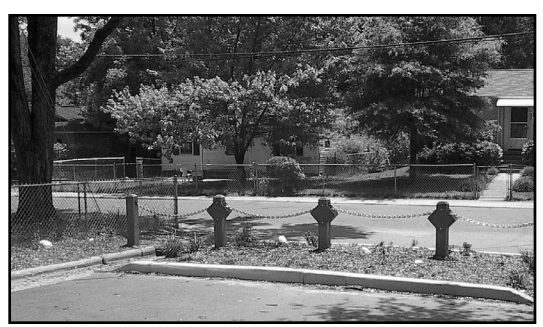
Beautified street barriers in Charlotte, N.C., helped control neighborhood violent crime and drug problems.

Research design: Adequate. A careful analysis was done, but only two barriers were installed.