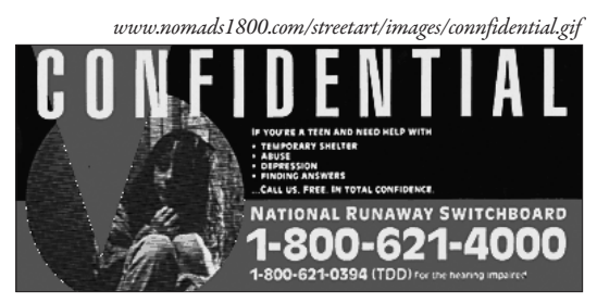
Hotlines refer juveniles to social services to shield them from the harms involved in living on the street. If desired, they also help runaways to contact their parents.

8. Using respite care. Runaway episodes are often triggered by escalating conflict at home that could be soothed if the family members were temporarily separated. Rather than using expensive detention facilities, police may transport juveniles to a respite care facility (e.g., a host home or small respite center). During a short stay (a few days to a few weeks), juveniles and their parents participate in counseling to begin to resolve the source of conflict and prevent future crises. Because of the short length of stay, respite care is considerably more cost-effective than placement in other juvenile institutions. <sup>71</sup>