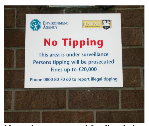
New rules were posted for disorderly behaviour