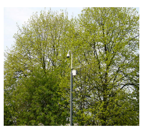
CCTV was placed in strategic locations