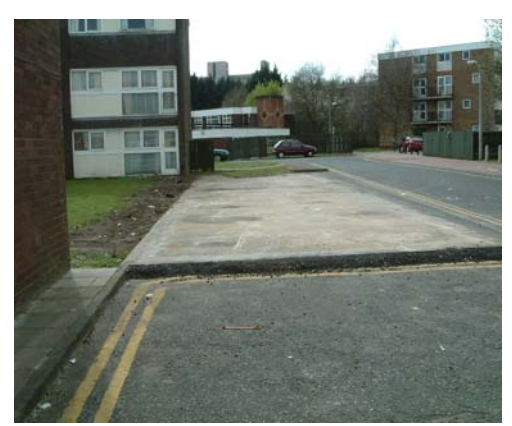
With resident support, they were removed during revitalization

The Central Housing Department were also responsible for the following responses: