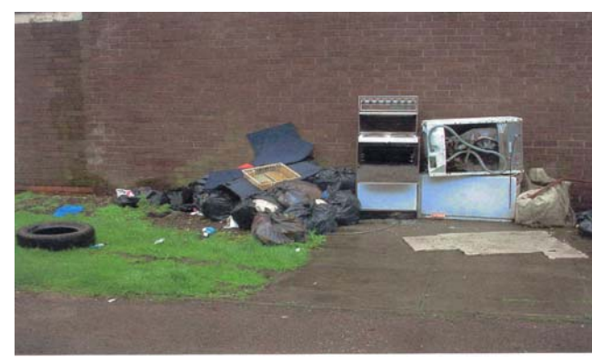
Fly tipping (littering) was a serious problem