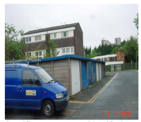
Specific garages were identified as part of the problem