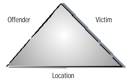
Figure 1: Crime Triangle

Every problem requires individual analysis because details about the victims, offenders, and locations will vary according to each problem and jurisdiction. In general, however, questions relating to the demographics (e.g. age, race, gender) and other potentially relevant factors of each crime triangle element should be included in every analysis plan.