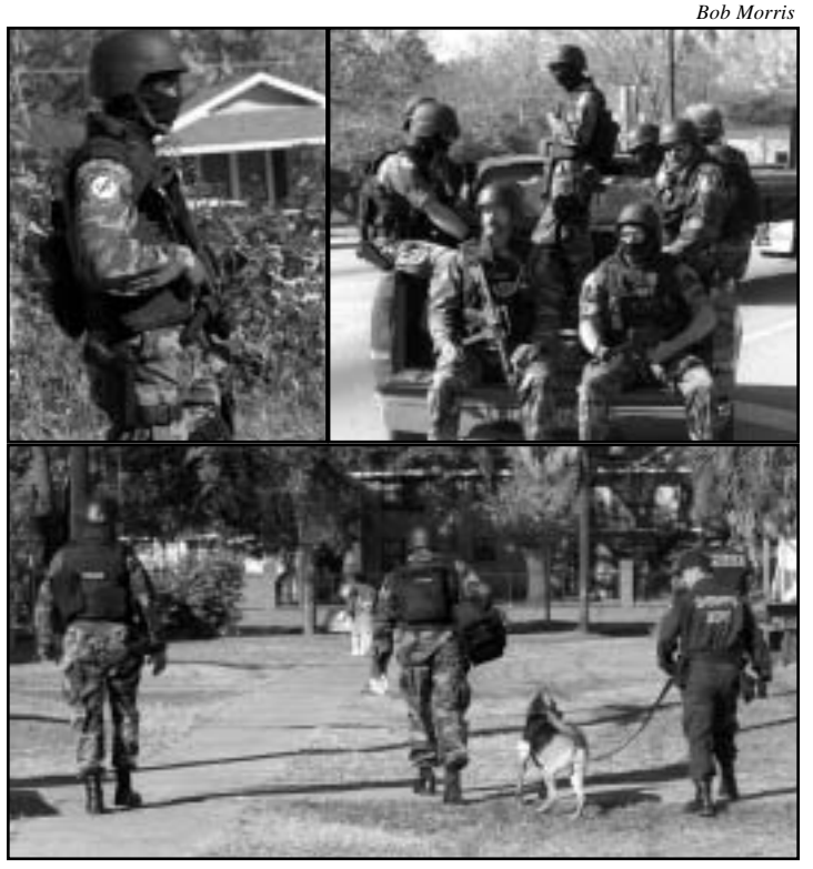
Combat uniforms and military-style gear and weaponry, designed to better protect officers as well as convey an image of seriousness, can also heighten fear among casual observers.