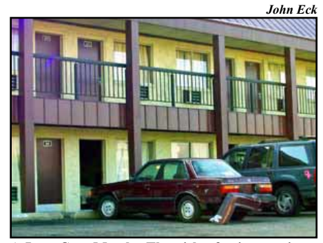
A Low Cost Motel: The risk of crime varies a great deal among facilities of the same type.

When analysts plot the number of crimes at each facility under investigation, they almost always create a graph with a reclining-J shape. This can be seen in the example in Figure 1, based on the work of crime analysts in Chula Vista, California. In that study, all parks over two acres in Chula Vista were ranked from the most crime (on left) to the least. The heights of the bars show the number of crimes in each park. As can be seen, three parks had far more crime than any of the rest and most parks had very little crime.