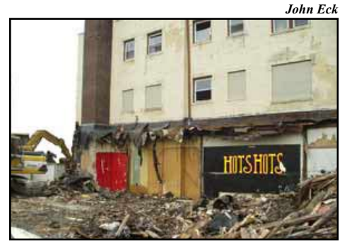
Demolition of a Former Bar and Drug Dealing Hot Spot: Removing a very risky facility can be the best way to reduce crime.

§ For a more extensive discussion of obtaining cooperation see Mike Scott and Herman Goldstein, Shifting and Sharing Responsibility for Public Safety Problems, Problem-Oriented Response Guide No. 3 (Washington, D.C.: Office of Community Oriented Policing Services, U.S. Department of Justice, 2005).