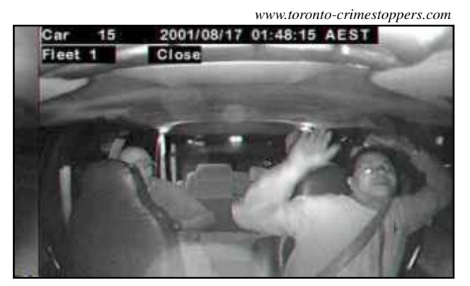
Security cameras in taxis can capture robberies in progress.

area. One danger for drivers having cameras in their cabs is that they may begin to rely on the camera as a substitute for their own careful assessment of their passengers and may fail to use their normal precautions.