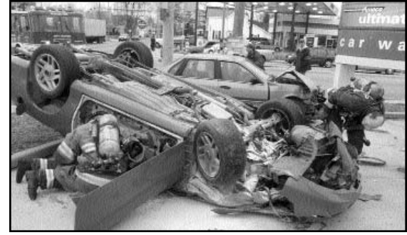
Crashes caused by street racing are often spectacular and cause serious injury and property damage.