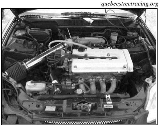
Many street racers spend large amounts of money upgrading their cars' performance.

Police suspect that many racers engage in illegal activities in order to finance their hobby; some agencies report that stolen vehicles have been stripped of parts that were later recovered from street racing vehicles.<sup>6</sup> Whether by lawful or unlawful means, many racers feel they must devote huge sums of money to "soup up" their race cars; a major upgrade, with supercharger blowers, nitrous oxide systems, and other high-performance equipment can easily exceed $10,000.<sup>7</sup> For many racers, getting the maximum performance out of their cars is very important to them and they will expend a tremendous amount of time, money, and effort toward that end.<sup>8</sup>