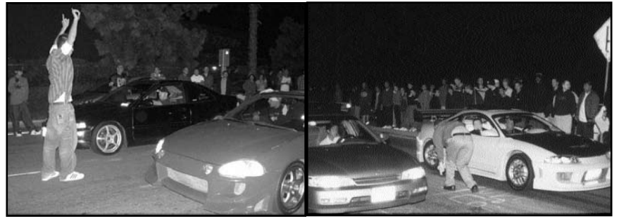
Race starters and observers are often positioned very close to the racing vehicles, putting themselves at considerable risk of injury.

Today in the United States, the racing tradition replays itself during every weekend in thousands of communities in the nation. The primary difference today is that street races are extraordinarily brazen and elaborately orchestrated functions, involving flaggers; timekeepers; lookouts equipped with computers mounted in their cars, cell phones, police scanners, two-way radios, and walkietalkies; and websites that announce race locations and even calculate the odds of getting caught by the police.<sup>17</sup> Some websites even provide recaps of the previous night's races, complete with ratings of police presence, crowd size, and a link to the police agency so the curious can see if a warrant has been issued for their arrest.<sup>18</sup>