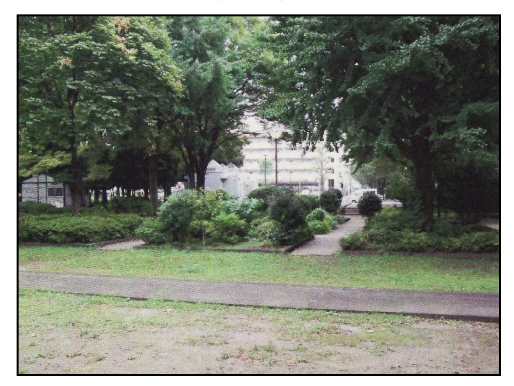
Before and after images of Kirigaoka Central Park