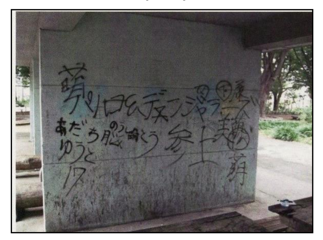
Before and after images of Kirigaoka Central Park