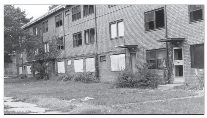
Urban areas with poorly-maintained, high-density low-income housing are often the site of open-air drug markets.

Key figures in the function of open-air drug markets are "place managers" such as landlords, housing authorities, local business residents and tenants associations. Those who diligently control their apartment buildings or the business premises forecourt will reduce the chance of an illicit market becoming established in their neighborhood, and drug sellers will often operate from locations where place managers do not attempt to exert any control over illicit activity. Open-air drug markets are therefore more likely to become established in areas where there is a high rate of rental properties and/or public housing rather than in owner-occupied neighborhoods.